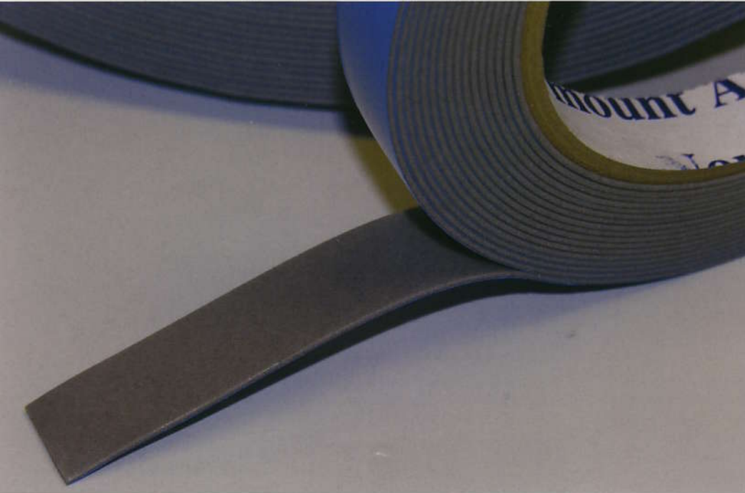
NORMOUNT® Acrylic A3100 Series