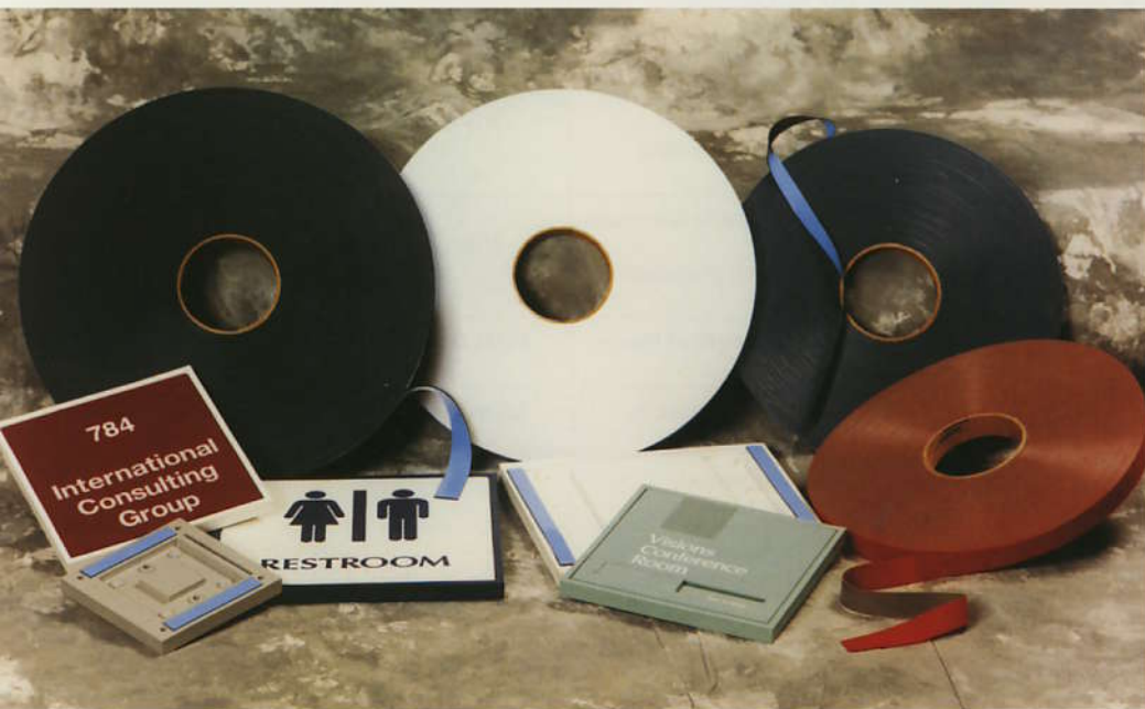
NORMOUNT V2800 AND V4600 BONDING TAPES ARE IDEAL FOR EXTERIOR MOUNTING APPLICATIONS.