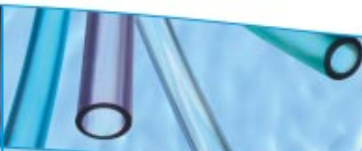
Vendflow® Taste Barrier Tubing, Formulation E-70-V-CE