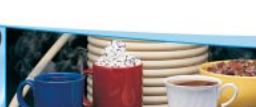
Norprene® Food Process Tubing, Formulation A-60-F