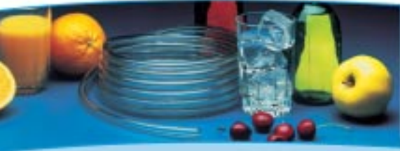
Tygon® Beverage Tubing, Formulation B-44-3